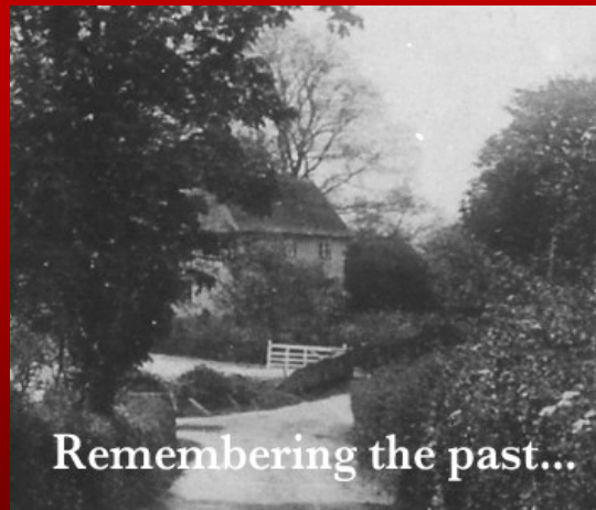
Remembering the past...

For further information about exhibitions and events at The History Centre, see www.thehistorycentre.org.uk