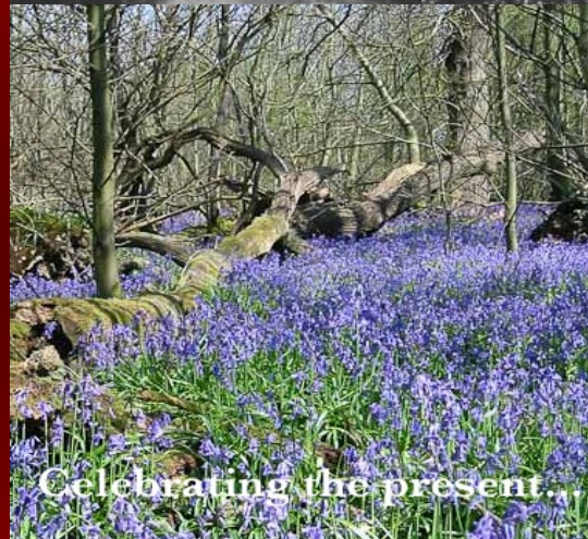
Celebrating the present...